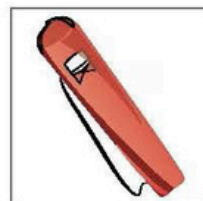
Folding Chair Bag (Folding Chair is Allowed)

FOR MORE INFORMATION GO TO PGATOUR.COM/ProhibitedItems