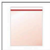
Tinted Plastic Bag