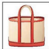
Over-sized Tote Bag