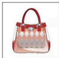
Printed Pattern Plastic Bag