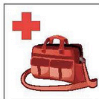
Medically Necessary and Diaper Bags*

*Infant and Medical supplies will be permitted after proper inspection.