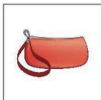
Bags smaller than 6"x6"x6"