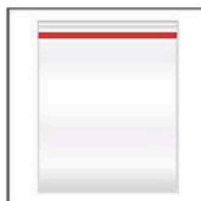
1-Gallon Plastic Freezer Bag